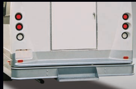
Standard fiberglass rear cap and steel rear bumper with rear step for ease of loading luggage into luggage area