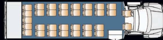
32 Passenger Plus Rear Luggage