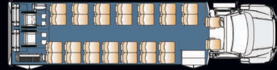
29 Passenger Plus 2 Wheelchair Positions Plus 2 Passenger Foldaway and Two 2-Passenger Flipseats