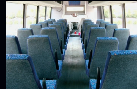
Large panoramic solid windows offer the best view for every passenger